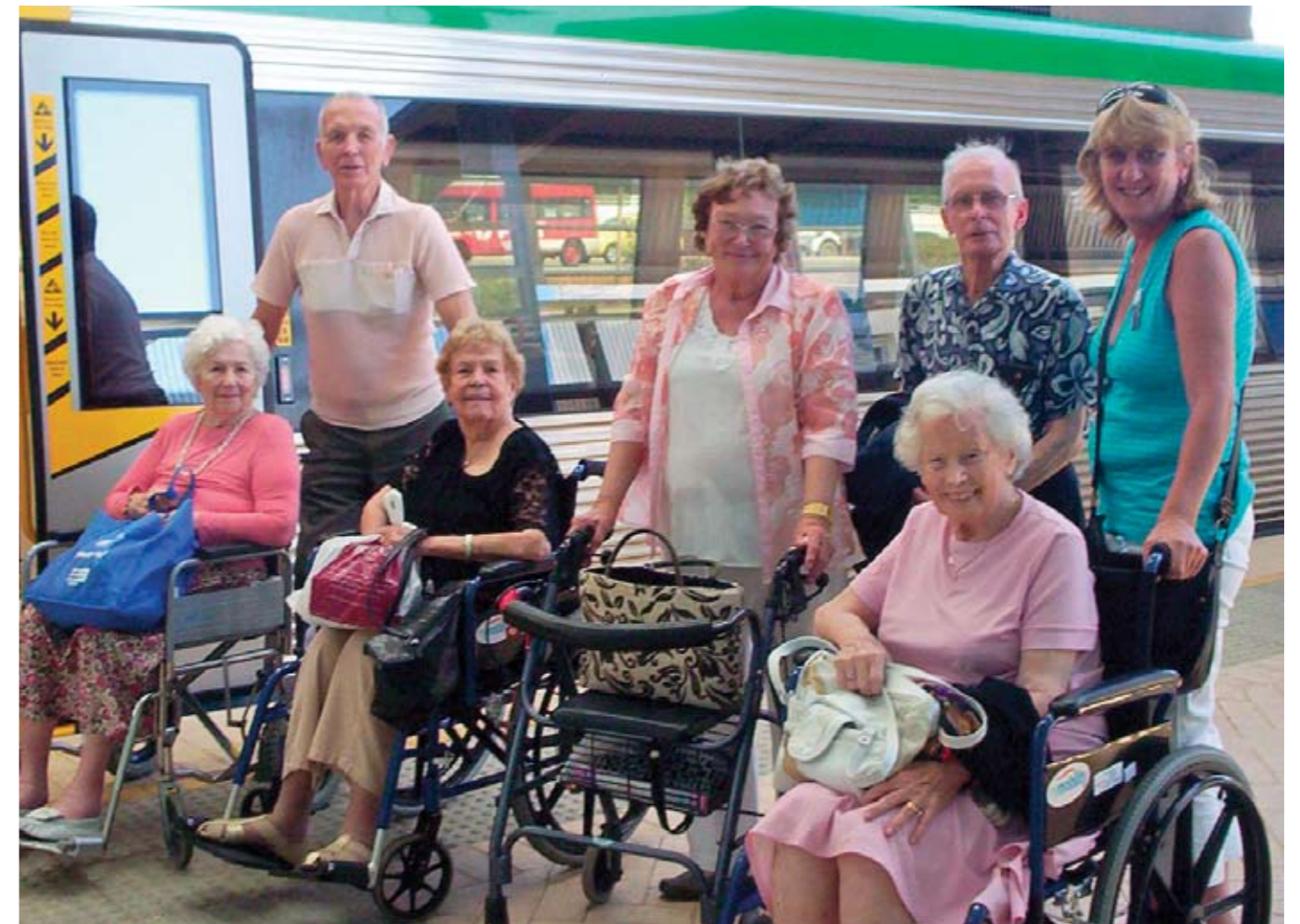
Wearne residents take a trip on the new Mandurah train line.

All who participated thoroughly enjoyed themselves and hope to make the journey again in the near future.