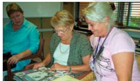
PEP celebrates life in pictures – page 4