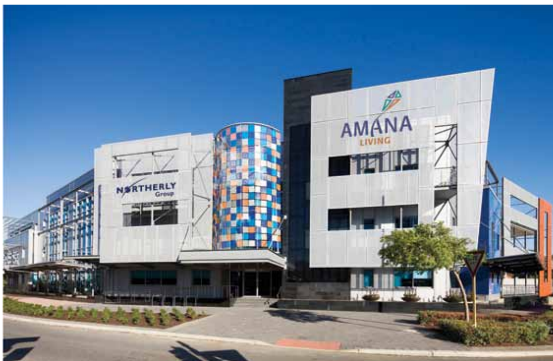
Amana Living Corporate Office, 541 Hay Street, Subiaco