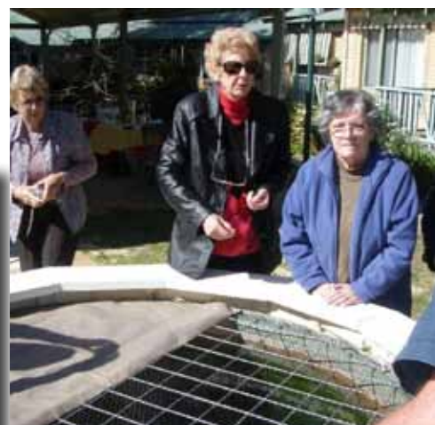
Residents feeding fish in aquaponics system