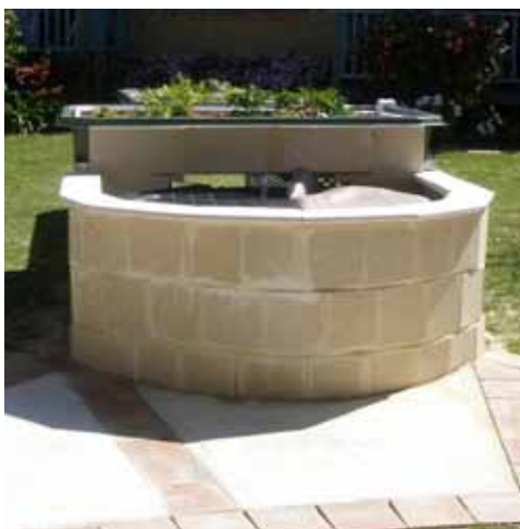
Aquaponics at Hale Hostel

Installing Aquaponics systems at two Amana Living centres has enabled the residents to be involved in the organisation's drive to improve environmental awareness.