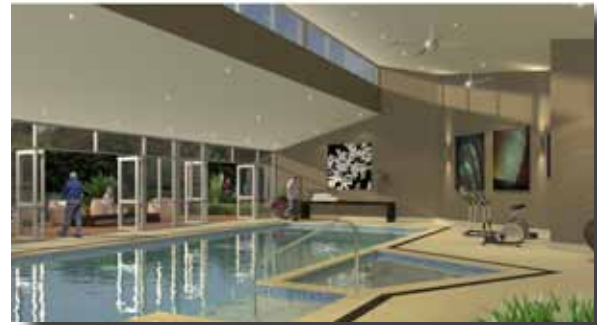
Treendale Club - artist's impression