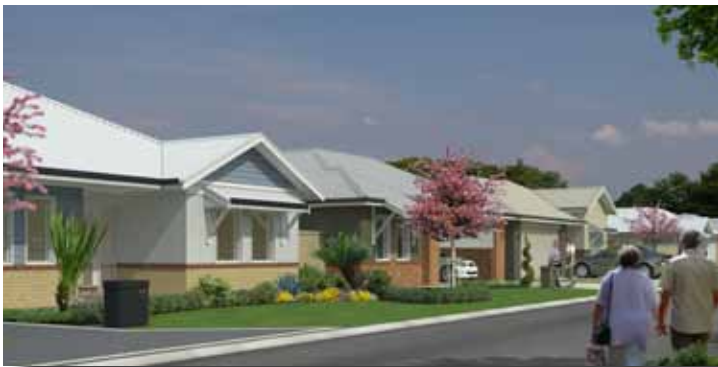
Treendale Estate streetscape - artist's impression

The Estate, a three bedroom, two bathroom villa complete with quality appliances, air conditioning and double garage is set in natural bushland on the banks of the Brunswick River, just a short drive from Australind and Bunbury.