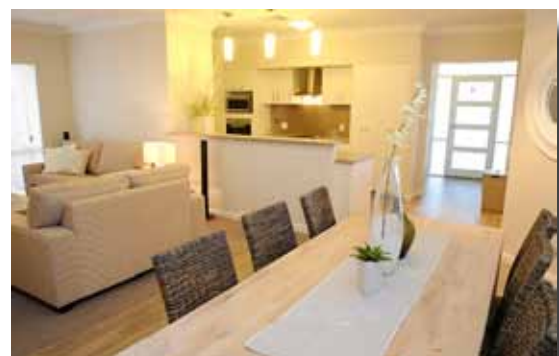
Dining and kitchen view of The Estate villa

House sizes at Amana Living Treendale range from 166.5sqm to 187.5 sqm. They include three bedrooms, a mix of one and two bathrooms and two toilets as well as a mix of single and double garages and convenient driveway parking for visitors.